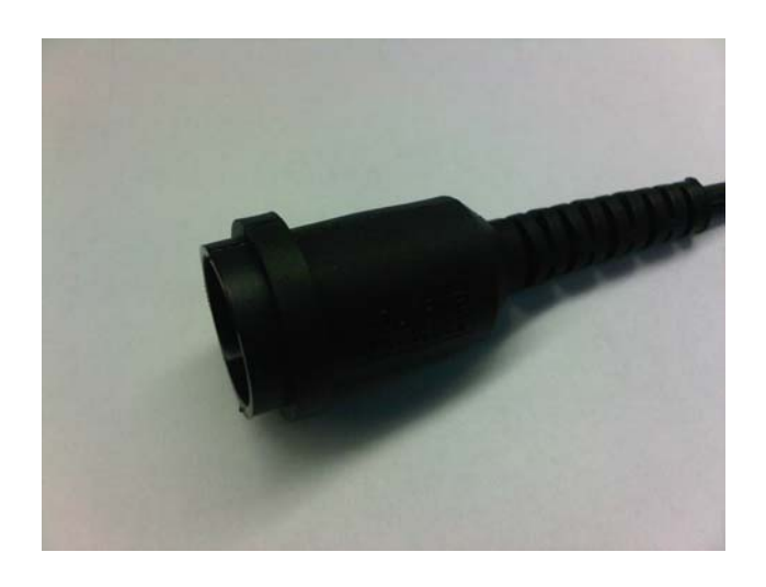
IS: P/N 47387 Series