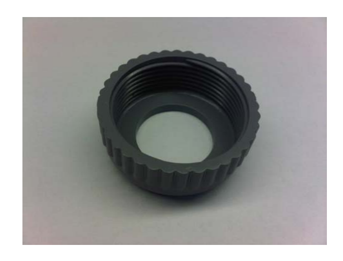
IS: P/N 17489-5